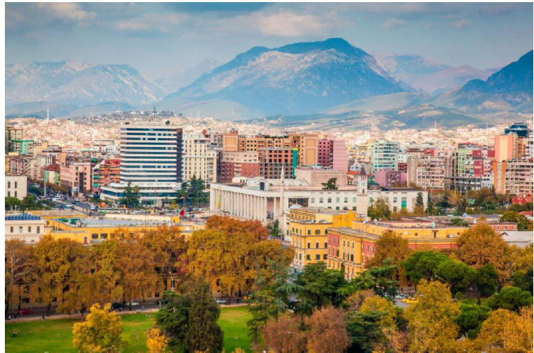
Tirana with Djati Mountains

Day 0: Monday, September 26. Arrive in Tirana on your own; take a taxi to the lodging (Hotel Austria). Dinner is on your own, but we will try to coordinate going together. We will gather briefly at 8pm to go over our plan to tour Tirana the next day.